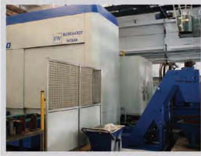
BW CNC vertical and horizontal machining center(Germany)