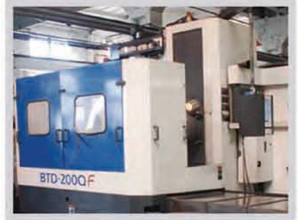
Toshiba horizontal machining center(Japan)