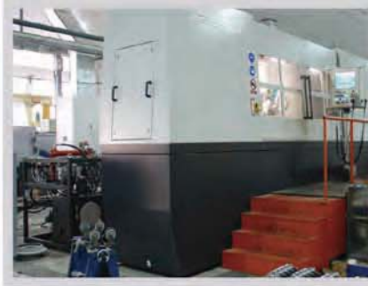
Holroyd rotor profile grinder(UK)